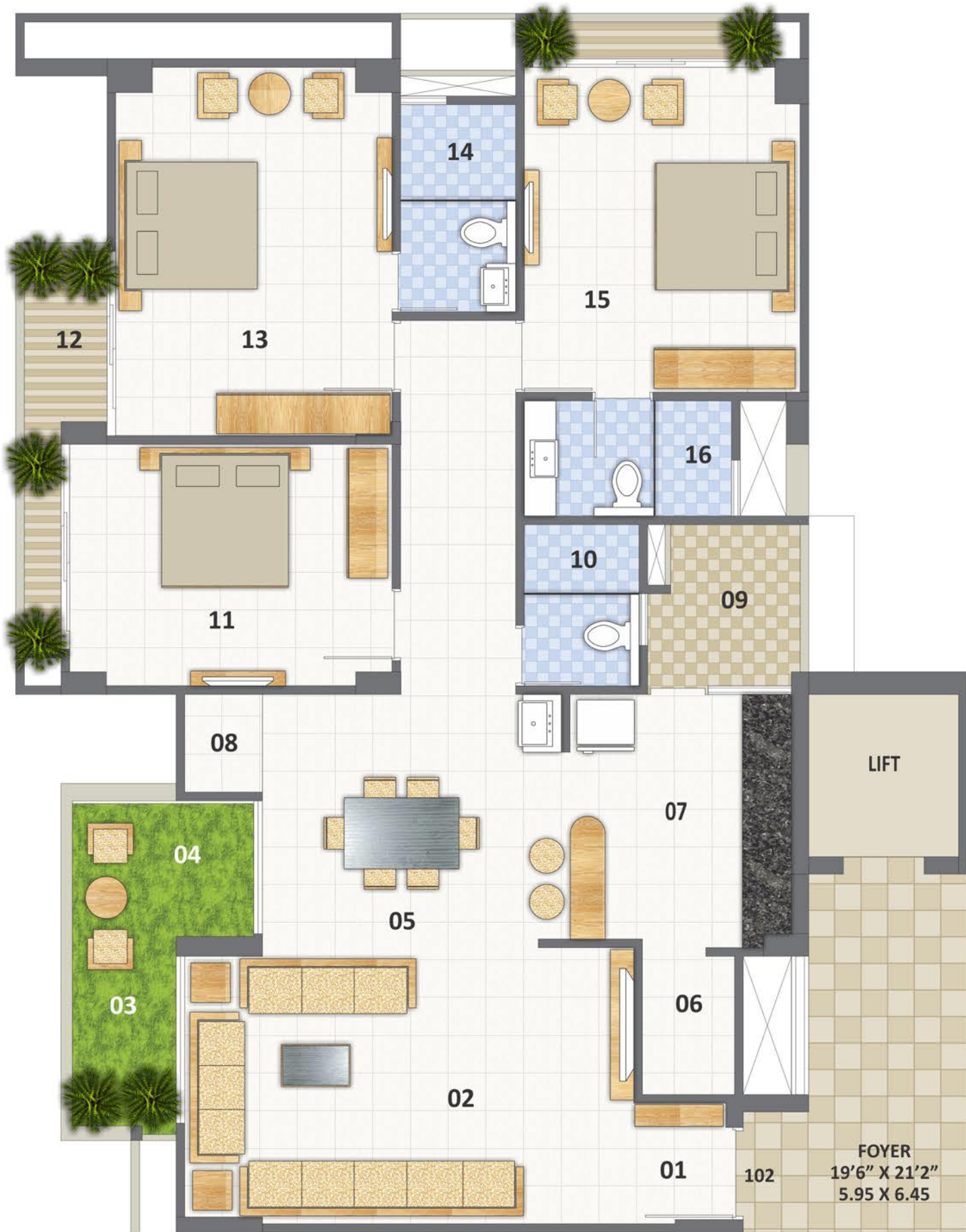
Unit Plan Type A Unit No.: 101, 102 & 104