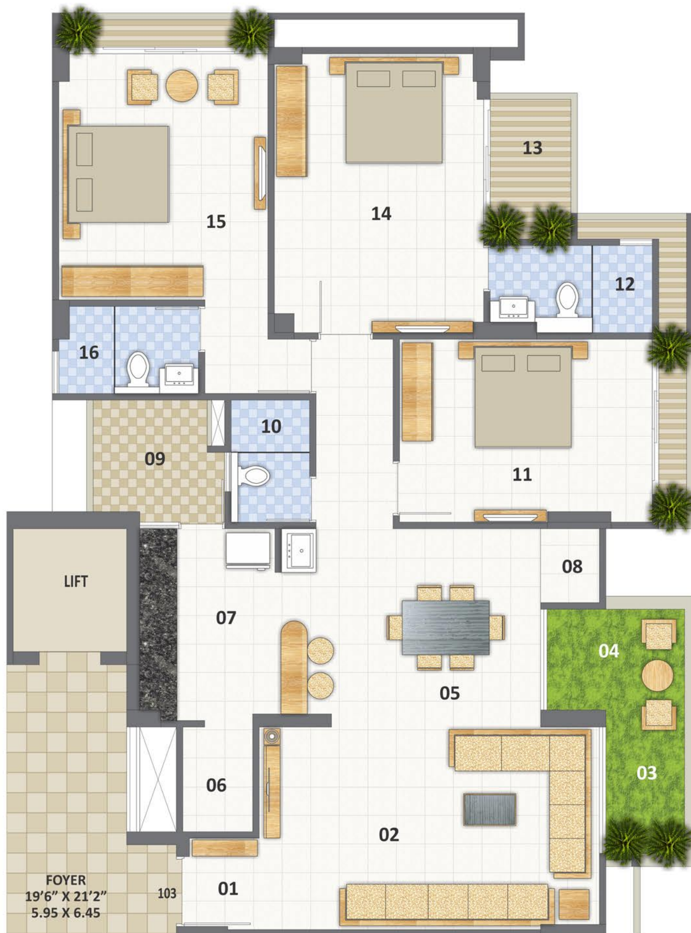
Unit Plan Type B