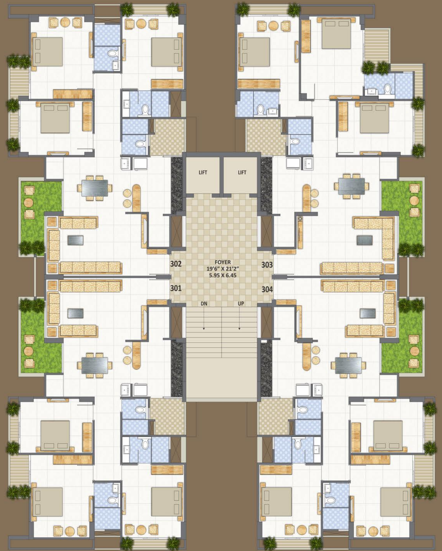
Typical Floor Plan 3rd to 9th & 11th-12th Floor